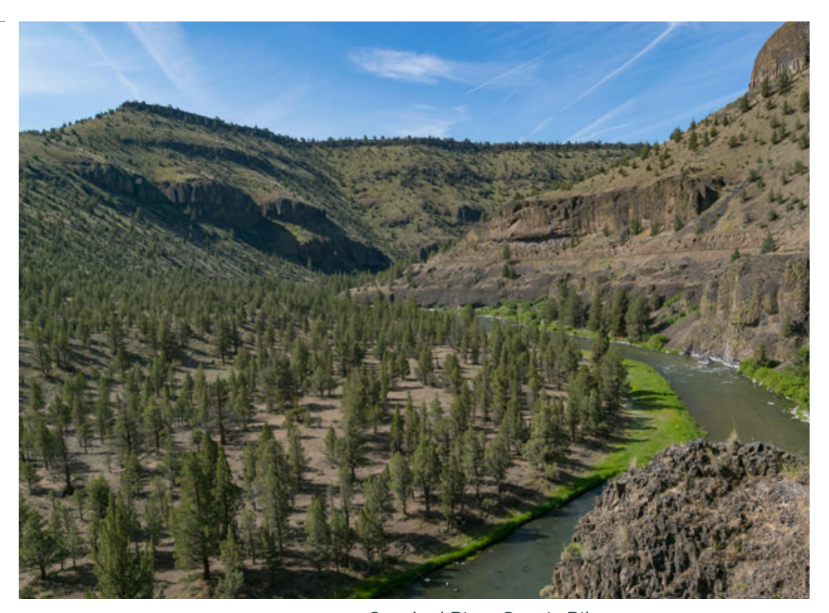
Crooked River Scenic Bikeway

patterns. We've ridden it in December at 53 degrees, but there have been years when we wouldn't want to venture out in the cold and snow. You can always try calling the bike shop ahead of time to get a report.